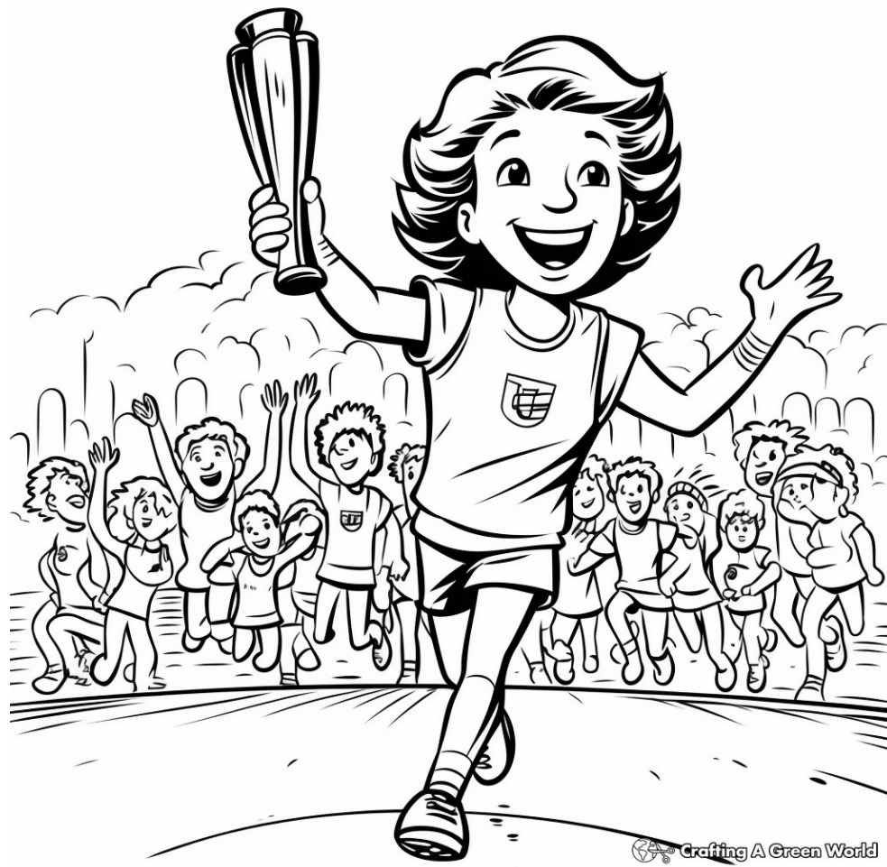
Crafting A Green World